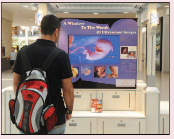
A Truth Booth on display in a shopping mall

missioned landmark psychological research on the emotions of women in crisis pregnancies. Its web site reports, "A communication strategy was birthed from this initial study that resulted in a complete paradigm shift within our own pro-life arena. ... This new approach was to be woman-centered and nonconfrontational, while inviting audiences to think critically about the issue." Its findings are still widely used in pregnancy center training manuals, and Vitae continues to study factors that influence women's pregnancy decisions.